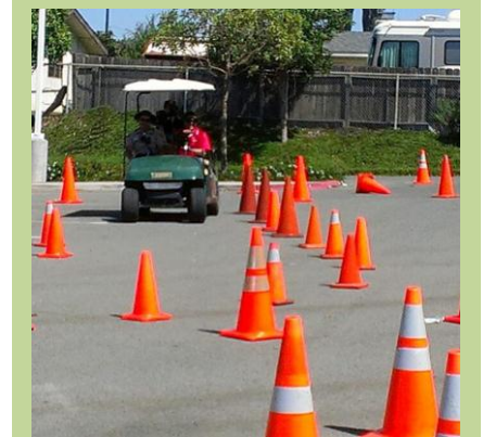
A mariner drives a golf cart while wearing "beer goggles"

In the parking lot, cones were set up to serve as a golf cart driving course. Here, students drove golf carts alongside an Imperial Beach sheriff while wearing "beer goggles", which altered their perception to how it would be if they were under the influence of alcohol.