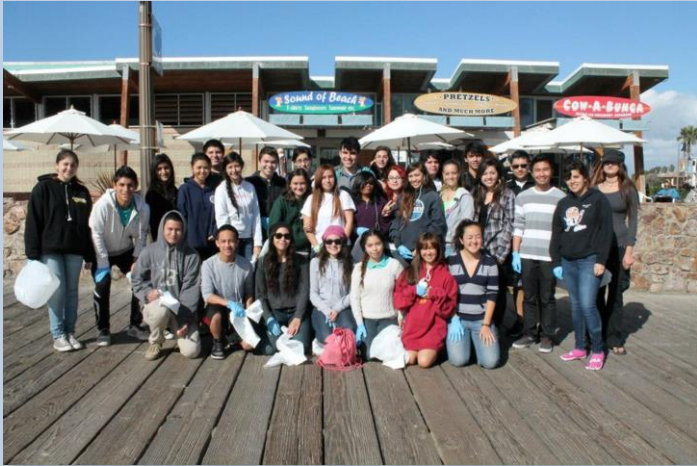
MVH's Key Club and Chula Vista's KIWINS joined forces to help clean Imperial Beach.