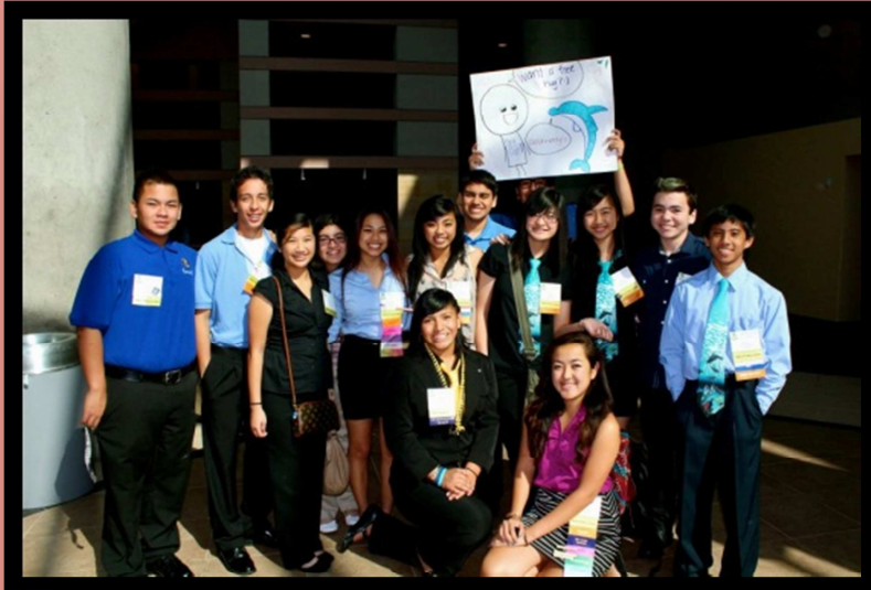
Division 11 representatives from Montgomery and Mar Vista High with their new LTG at D-Con.